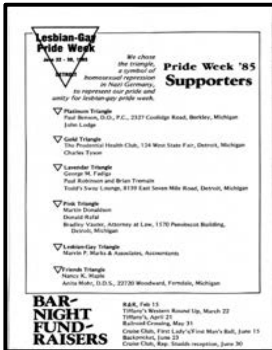
Flyer from 1985 Detroit Pride Week