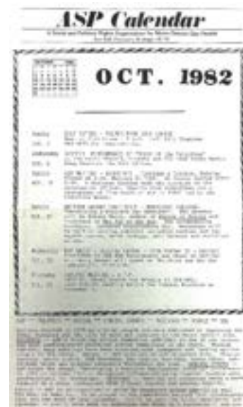
1 1982 October ASP Calendar