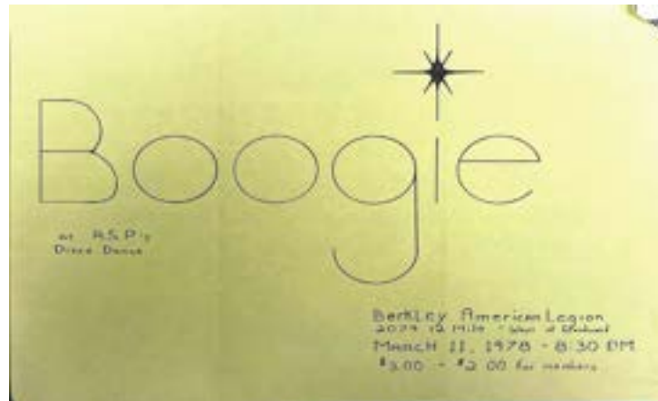
Flyer for the 1978 ASP Disco

The Association of Suburban People also held events in public spaces, including a dance at the Berkley American Legion in March of 1978, attended by more than 150 people. The 1978 edition of The ASP News and Happenings described the event as having turnout lower than anticipated, even losing $75 hosting the event, but took pride in the fact that they had “liberated on American Legion Hall.”