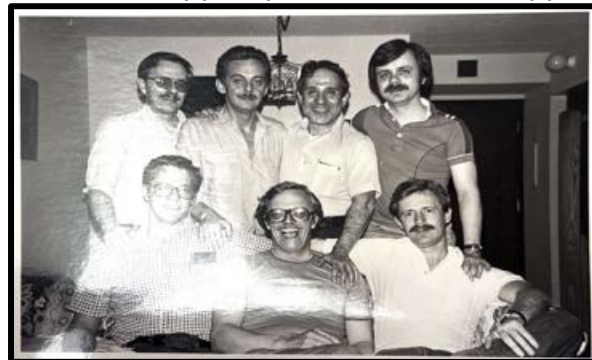
1982 Association of Suburban People Executive Board

The Association aimed to provide opportunities for queer fellowship, networking, and political activism. According to a 1977 press release, "the primary function of the [Association of Suburban People] is to advance and defend the legal and civil rights of persons whose sexual or affectional orientations have subjected them to social or legal discrimination. The Association has established three major thrusts of activity. First, ASP will work to eliminate laws penalizing private sexual acts between consenting adults... Second, ASP will work to influence legislation enacted by State and Local governments to eliminate discrimination based on sexual orientation. Third, ASP will provide to its members and friends social alternatives to the bars in a suburban setting. Membership in ASP is open to any registered voter residing in the Detroit Metropolitan Area. It is not affiliated with any political party, but will endorse and support political leaders supporting its goals".